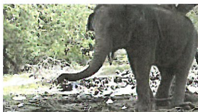
Tourist 'killed on elephant ride'