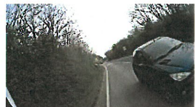
Cyclist helmet camera captures motorist driving at cyclist